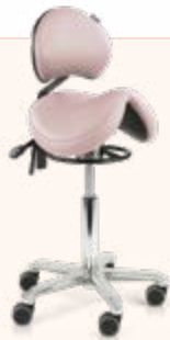
score jumper balance with lumbar support

The adjustable lumbar support is suitable for four Score Balance models. We have listed the specifications of these four models for you below.