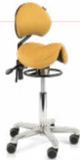
score amazon balance with lumbar support