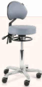
score medical 6211 balance with lumbar support

Contact us on +31 (0)594 - 55 40 00 or put together your favourite chair on www.scoreseating.com