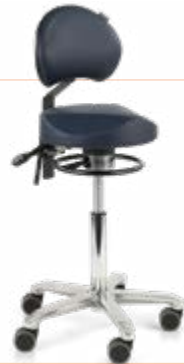
medical 6311 balance with lumbar support